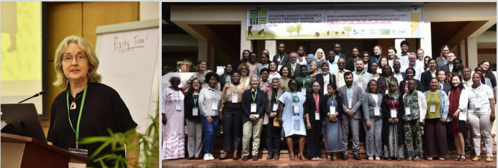
CIFOR-ICRAF hosts a 3-day Women's Resource Rights learning and capacity development conference. The event's primary focus is Gender Transformative Approaches (GTA) in the context of land resource rights.

On February 27, 2024, the awareness cum demonstration programme emphasizing on broomgrass initiative, was held in Mawtepiew village within the Mawsynram C&RD Block. Simultaneously, the Financial Literacy Camp (FLC), jointly organized by the DPMU-SWKH office and MCAB Mawkyrwat Branch, convened at the BDO Office Hall in Ranikor C&RD Block.